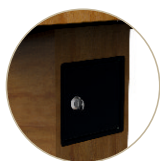
Steel safe with locking key