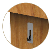
Way-out for rejected coins